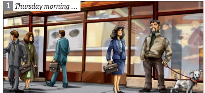
1 Thursday morning ...

Here's Lucy now with Sarah Chen and Peter Columbo. Lucy's the woman wearing a skirt. She's British and she works for an advertising agency. She's a personal assistant, but she doesn't like her boss, Olive Green. Sarah's a postgraduate student at London University. She's from Singapore. Peter's from the USA. He works for a magazine company. Peter and Sarah are getting married soon.