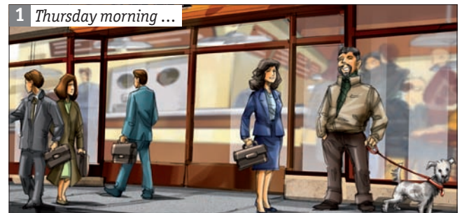
1 Thursday morning ...

Hi. My name's Cindy Gaskell. My 1 _____ Ryan and I own this Internet café – The Coffee Shop. I'm British, but Ryan's 2 _____. We've got two children – Melanie and Russell. Melanie's a student at Manchester University and Russell works in Spain for a 3 _____ company. That's Ryan over there – the man with the beard. He's talking to Jordan Morris. Jordan's Australian and he's a computer engineer. He's 4 _____ our computers, but he isn't doing that now. He's waiting for his girlfriend, Lucy Patterson. Actually, Jordan really wants to be an actor. He was in a TV advert last year.